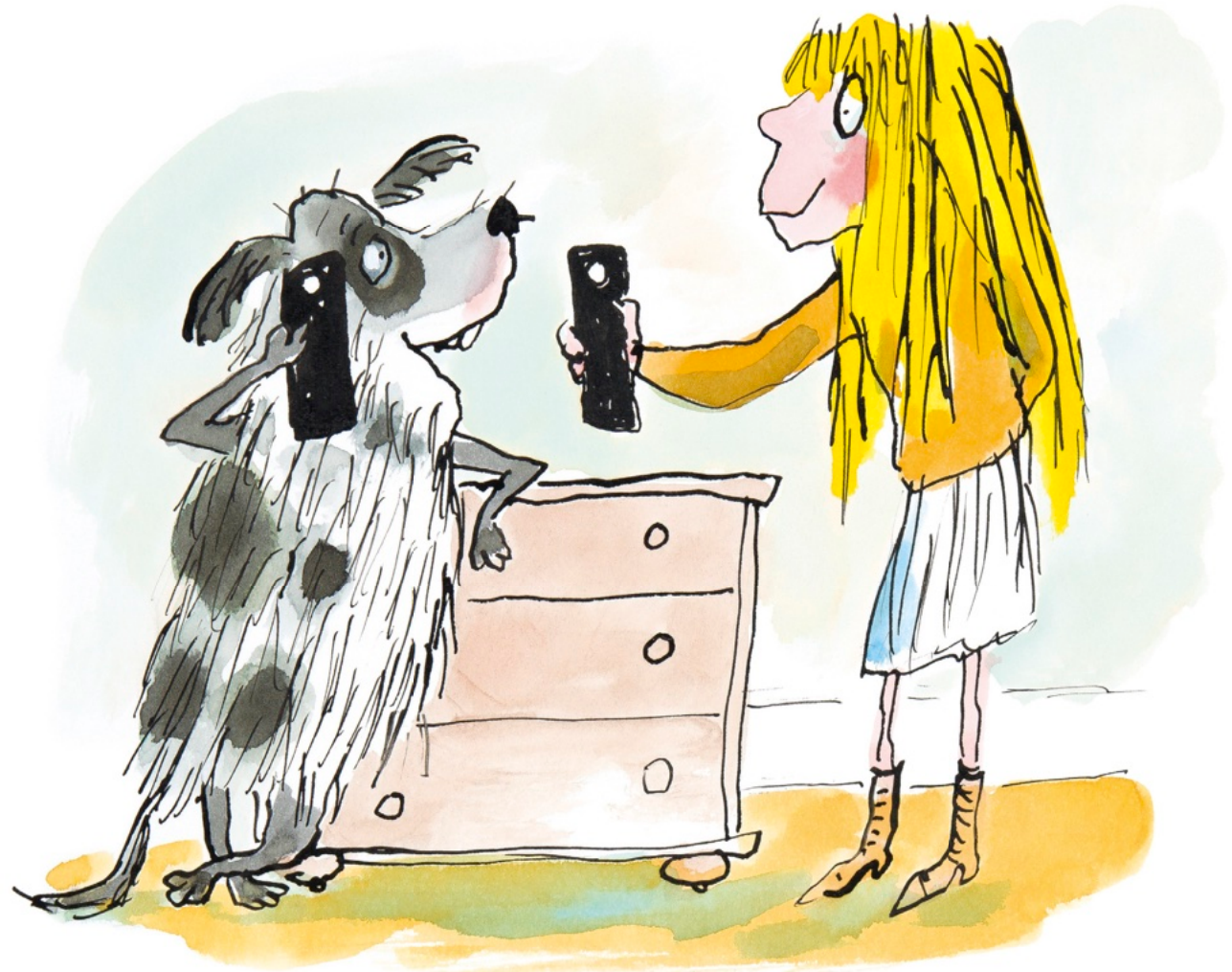
She shared a talking dog called Rover,